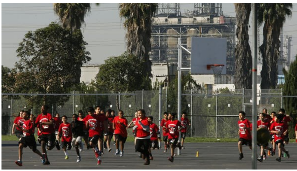
Figure 2. "Students jog on the playground at Elizabeth Hudson K-8 Elementary School in Long Beach. The school sits near the Tesoro oil refinery, the Terminal Island Freeway, a railroad line and the Port of Long Beach."

A clause allows for the construction of a school near a highway (absent of mitigation) if the school district is "unable to locate an alternative site that is suitable due to severe shortages of sites."